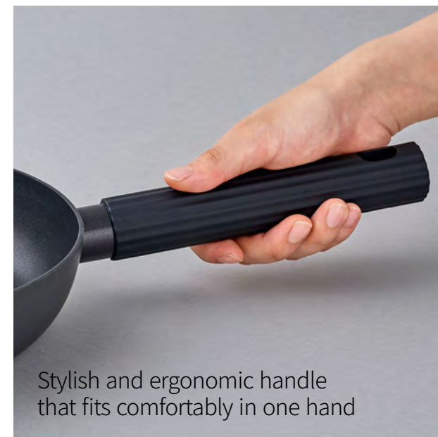
Stylish and ergonomic handle that fits comfortably in one hand