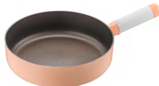
LOP1225IH SIZE 346x226x63mm CTN 8 PCS / 0.063 CBM