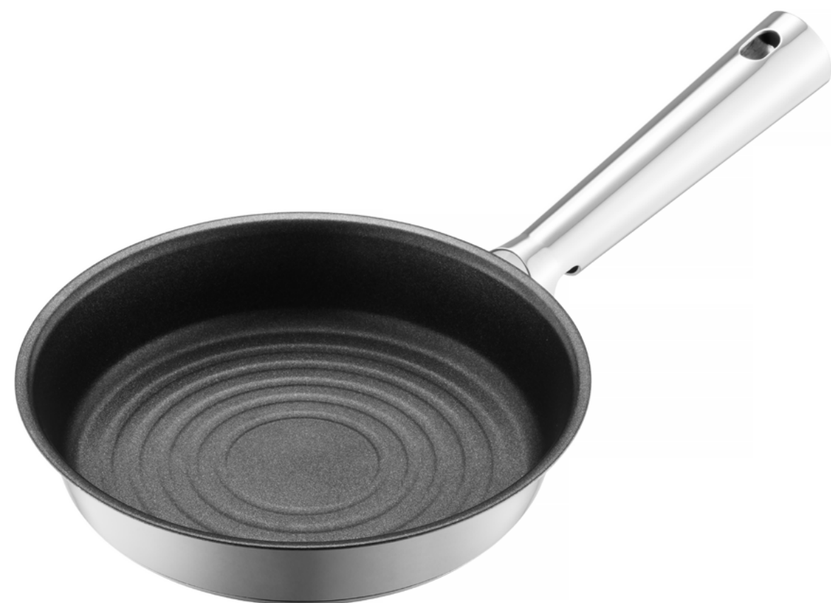
CSF2020 SIZE 384x200x41mm CTN 4 PCS / 0.023 CBM