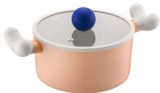
LOP1182IH SIZE 280x186x135mm CTN 6 PCS / 0.045 CBM