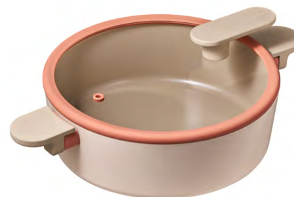
CAL2455IH SIZE 365x240x117mm CTN 4 PCS / 0.049 CBM