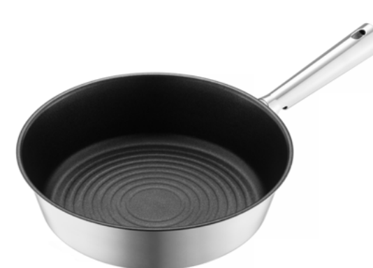
CSW2820 SIZE 464x280x83mm CTN 4 PCS / 0.058 CBM