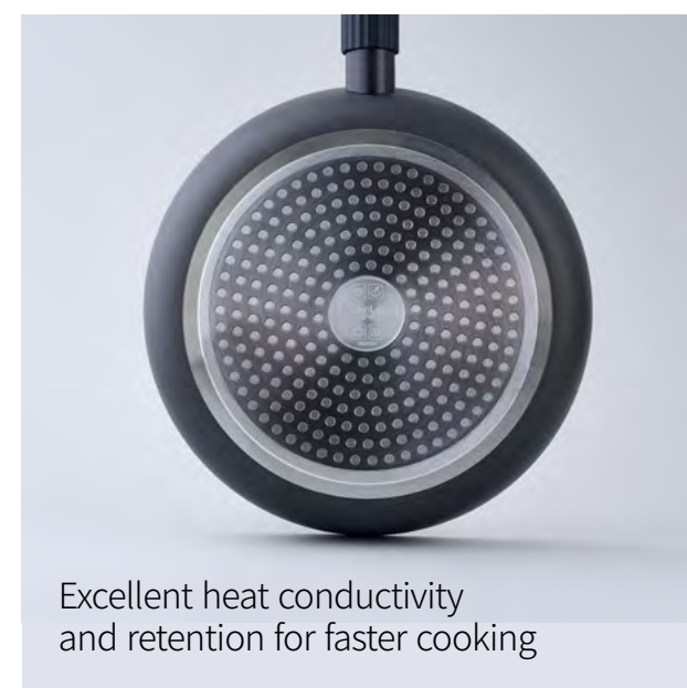
Excellent heat conductivity and retention for faster cooking