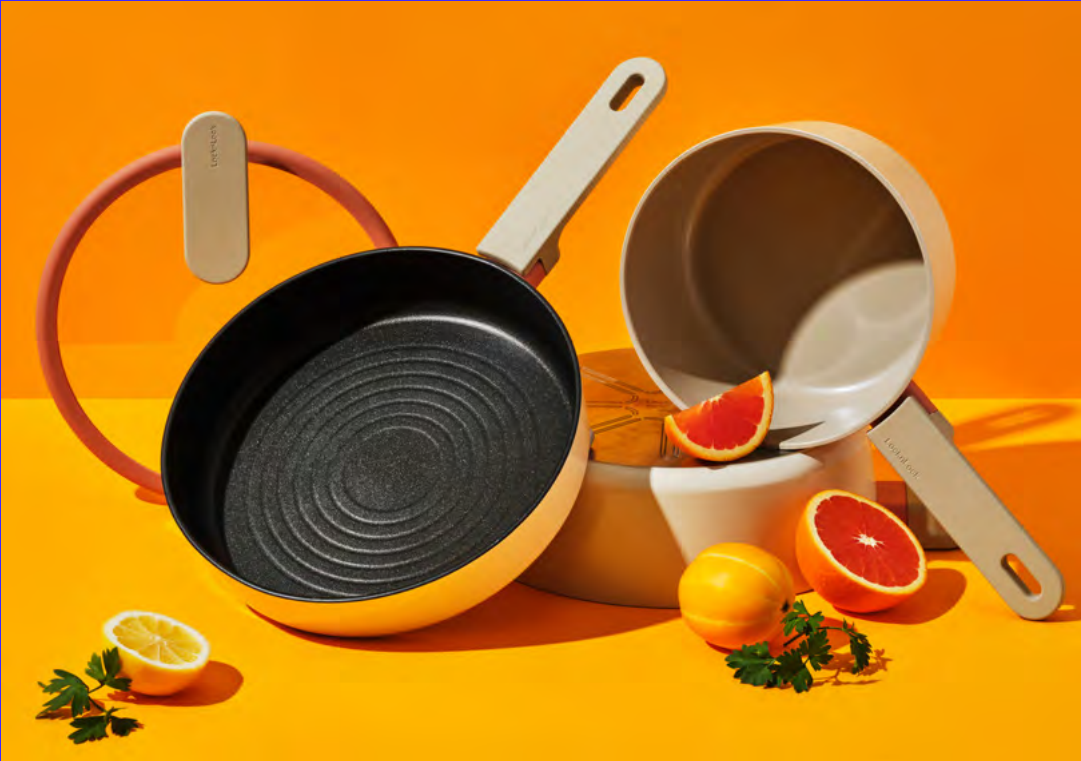
Suit BRIC SPECIAL