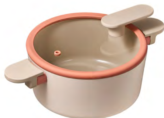
CAC2055IH SIZE 325x200x130mm CTN 6 PCS / 0.063 CBM