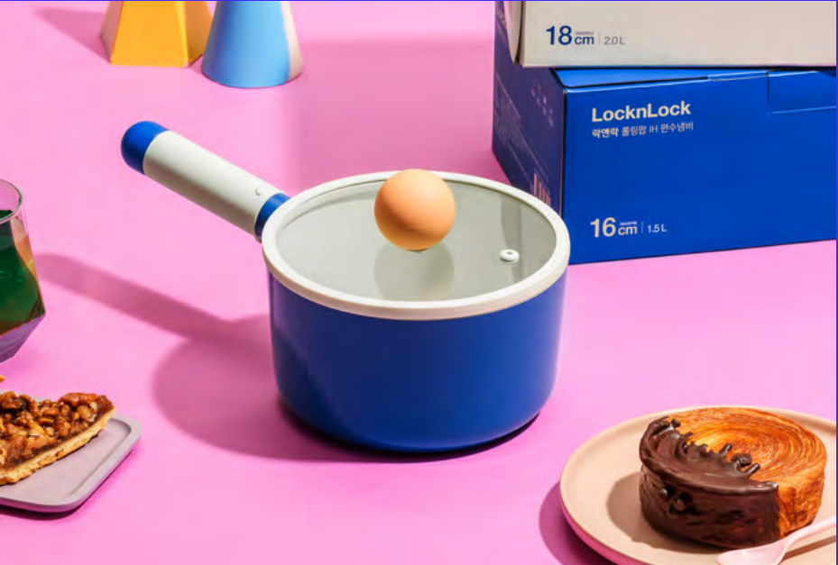
Rolling Pop SPECIAL