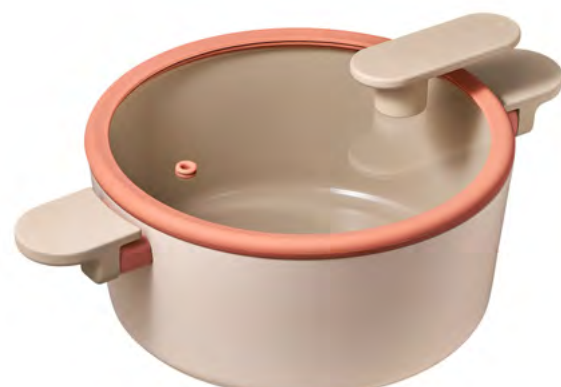
CAC2255IH SIZE 345x220x137mm CTN 4 PCS / 0.049 CBM