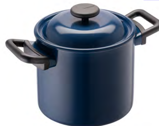
LDE1204IH SIZE 328x214x223mm CTN 4 PCS / 0.07 CBM