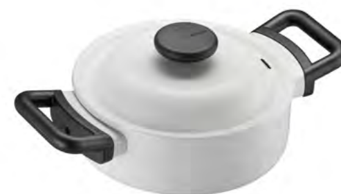
LDE1207IH SIZE 367x254x115mm CTN 6 PCS / 0.05 CBM