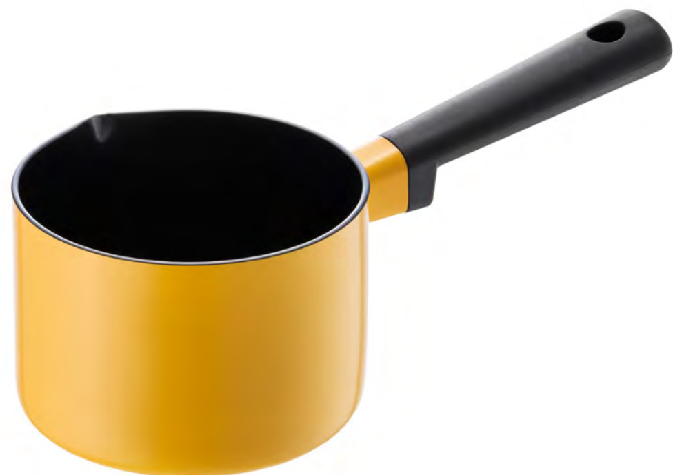
LDE1142 SIZE 300x160x110mm CTN 6 PCS / 0.039 CBM