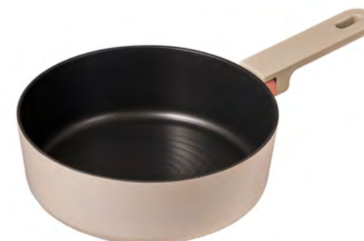
CAW2255IH SIZE 375x220x75mm CTN 8 PCS / 0.044 CBM