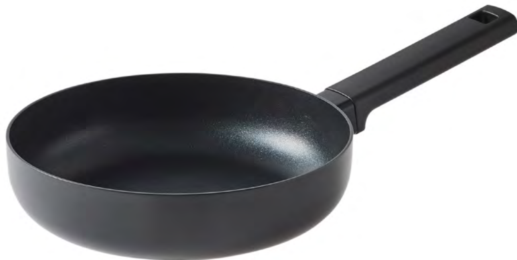
LMH2203IH SIZE 315x420x195mm CTN 8 PCS / 0.026 CBM