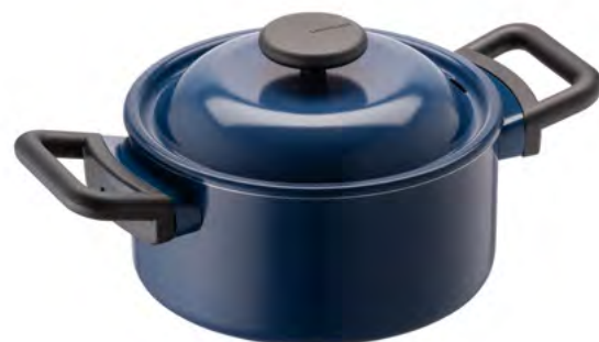
LDE1202IH SIZE 327x215x143mm CTN 4 PCS / 0.046 CBM