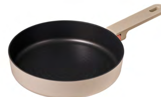
CAF2455IH SIZE 410x247x55mm CTN 8 PCS / 0.039 CBM