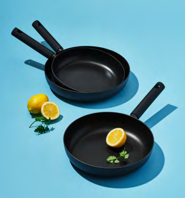
HARD & LIGHT Pro SPECIAL