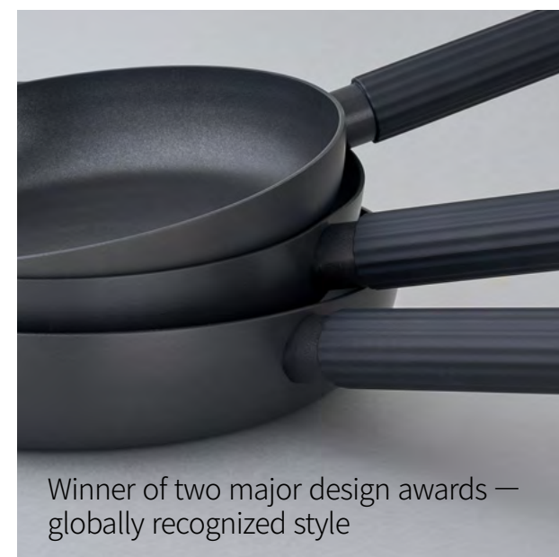
Winner of two major design awards — globally recognized style