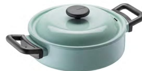
LDE1244IH SIZE 327x212x118mm CTN 6 PCS / 0.065 CBM