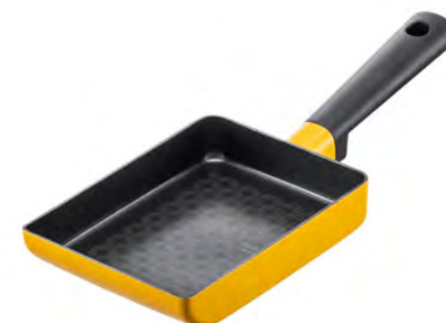
LDE1186IH SIZE 340x138x55mm CTN 12 PCS / 0.051 CBM