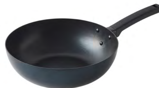
LMH2305IH SIZE 474x590x216mm CTN 6 PCS / 0.06 CBM