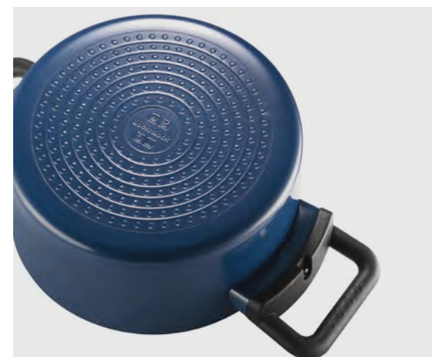
Comfortable handle designed with enhanced safety in mind