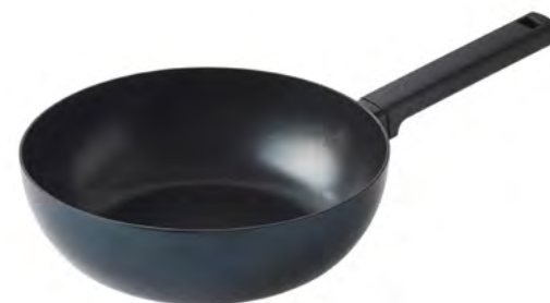
LMH2265IH SIZE 360x541x196mm CTN 6 PCS / 0.038 CBM