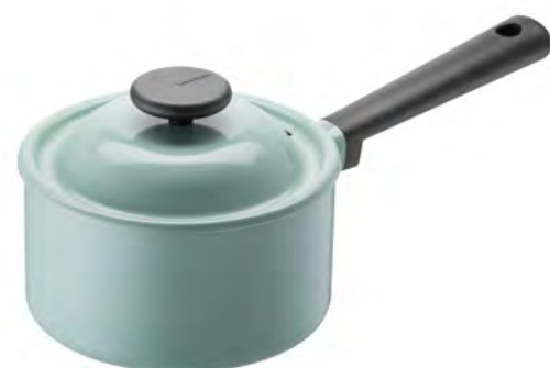
LDE1181IH SIZE 380x196x146mm CTN 6 PCS / 0.065 CBM