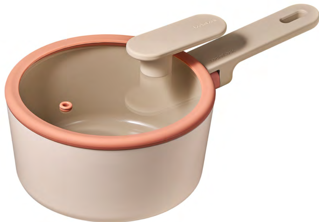
CAS1855IH SIZE 335x180x120mm CTN 6 PCS / 0.063 CBM