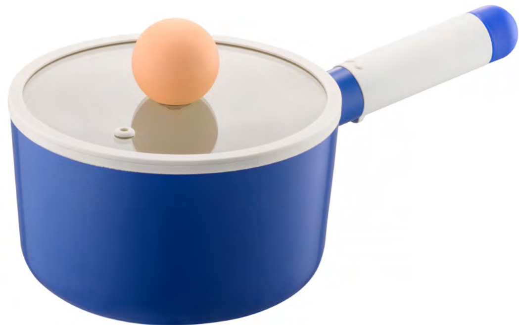
LOP1161IH SIZE 291x166x133mm CTN 8 PCS / 0.051 CBM