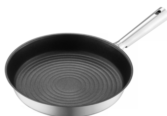
CSF2820 SIZE 464x280x53mm CTN 4 PCS / 0.04 CBM