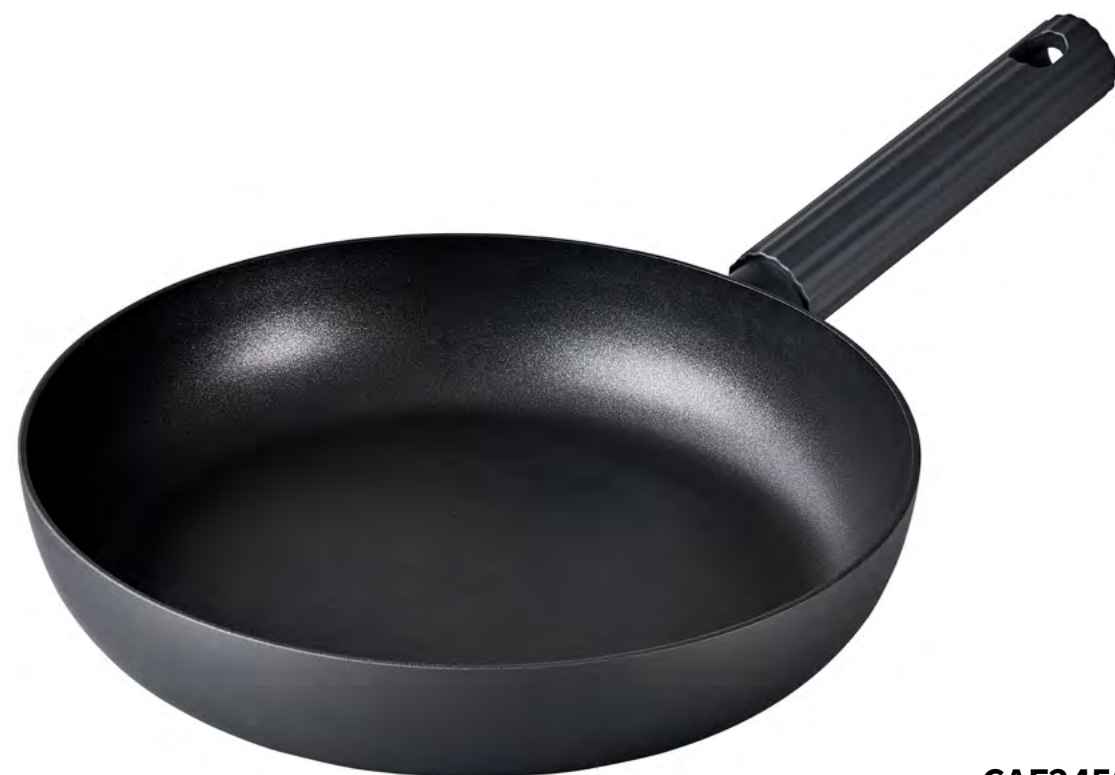
CAF2458IH SIZE 275x455x285mm CTN 6 PCS / 0.036 CBM